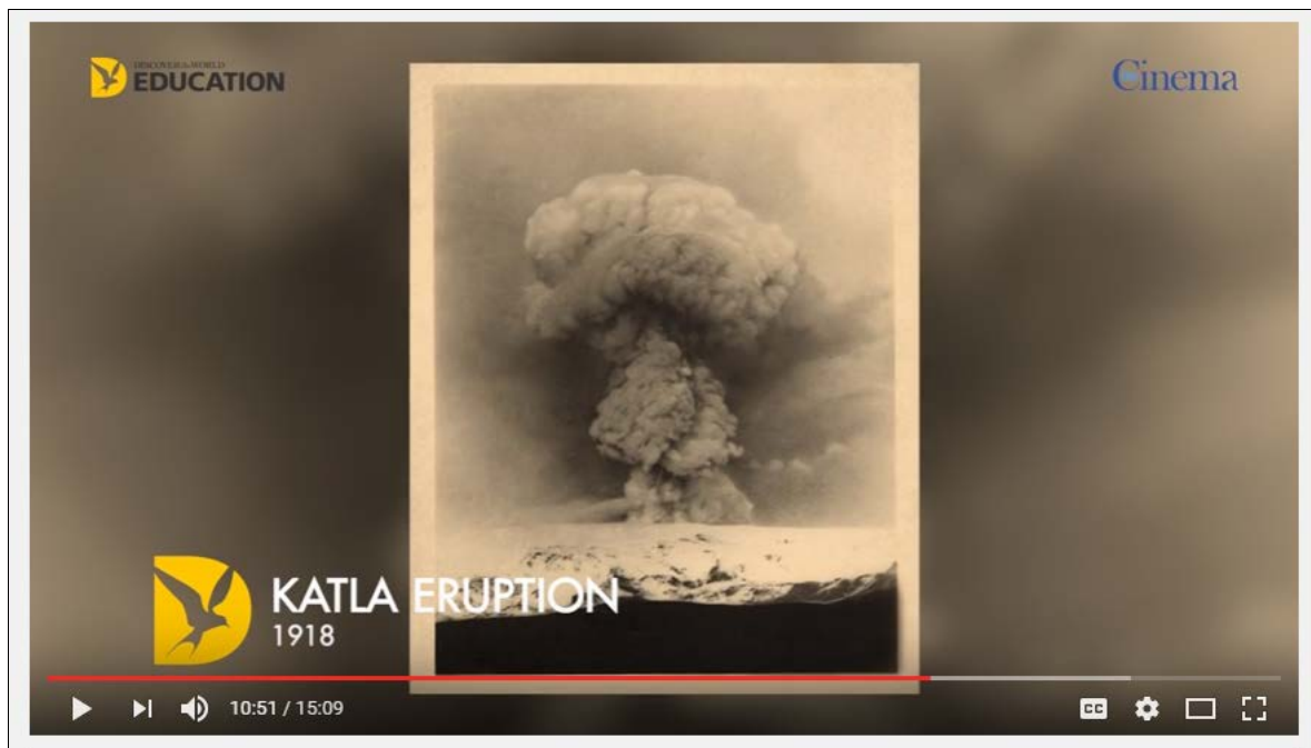
The Katla eruption, 1918