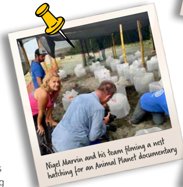
Nigel Marvin and his team filming a nest hatching for an Animal Planet documentary