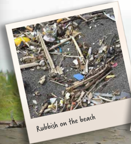
Rubbish on the beach