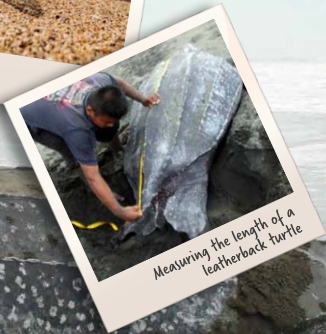
Measuring the length of a leatherback turtle