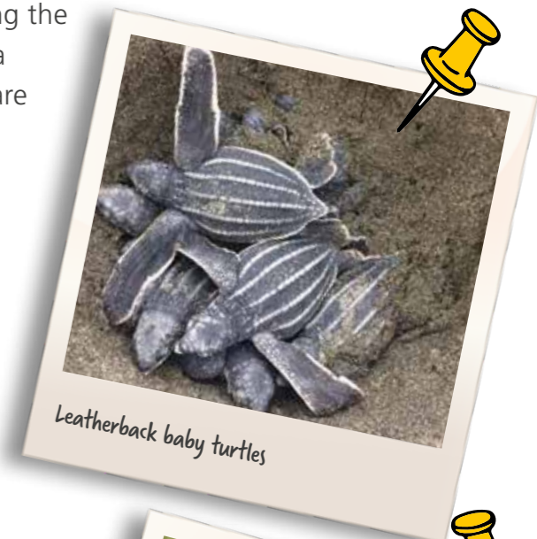
Leatherback baby turtles